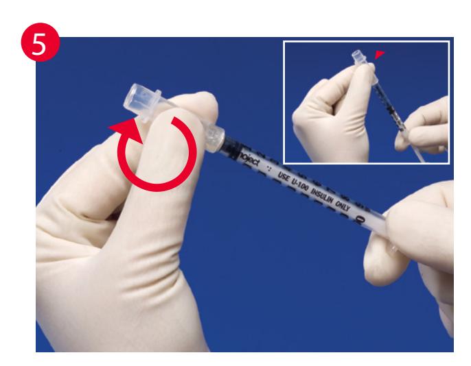
To permanently lock syringe, extend shield forward until it clicks, then twist the shield in either direction until it clicks again to indicate final-lock.