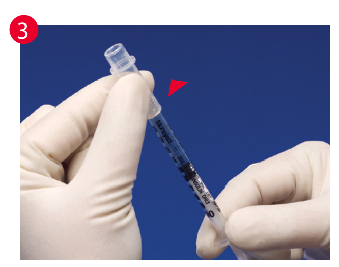
To transport syringe, extend the shield forward until you hear and feel a click. The needle is now protected for transport but the syringe is not permanently locked.