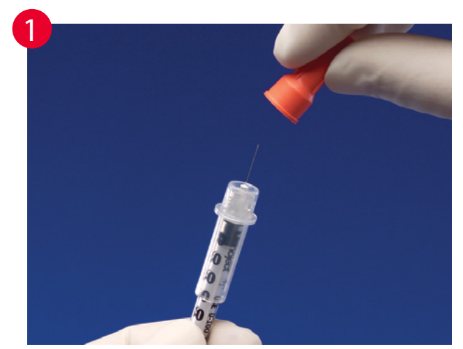
Remove syringe from package and discard tip cap. Recapping is not necessary with this syringe.