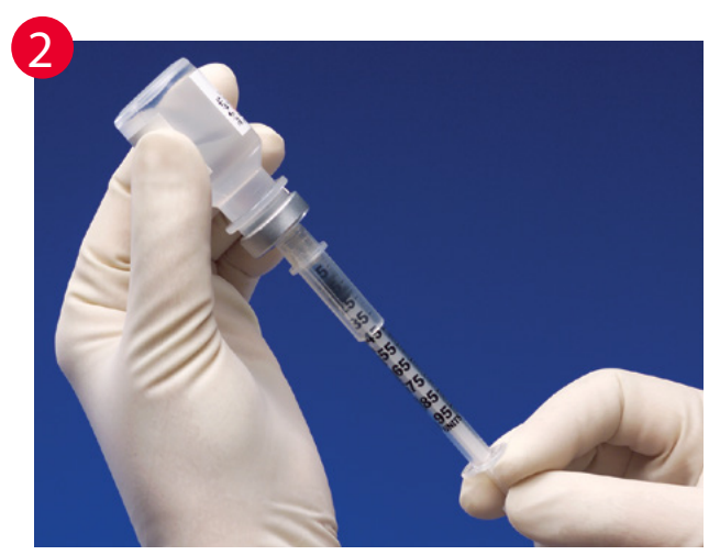
Draw medication from vial according to your facility's protocol.