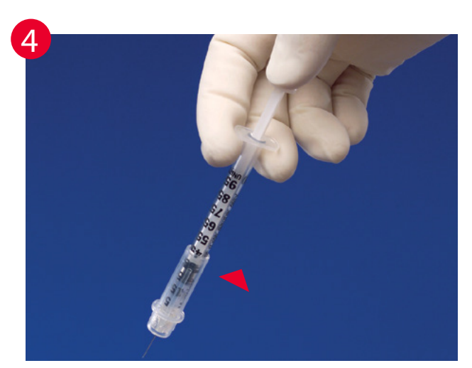
To give injection, slide shield back to its original position exposing the needle. Perform injection following facility protocol.