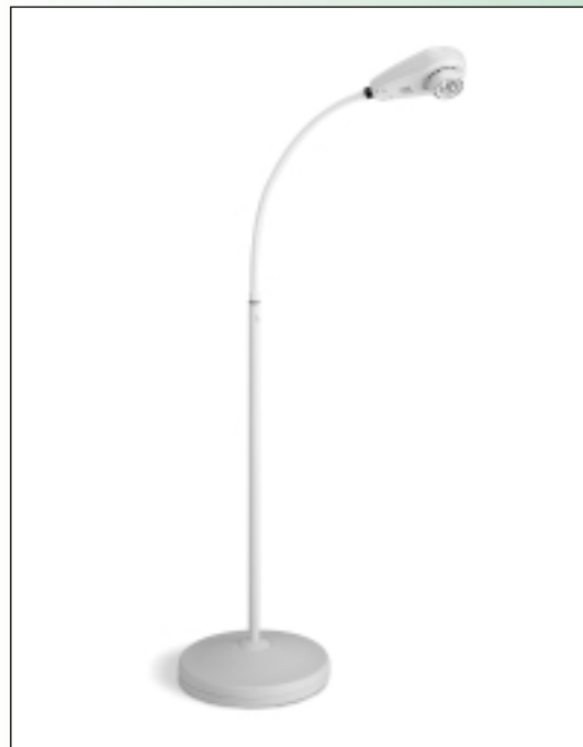
LS-135 Examination Light

*For appropriate model number outside of U.S.A., please advise country and voltage required when ordering.