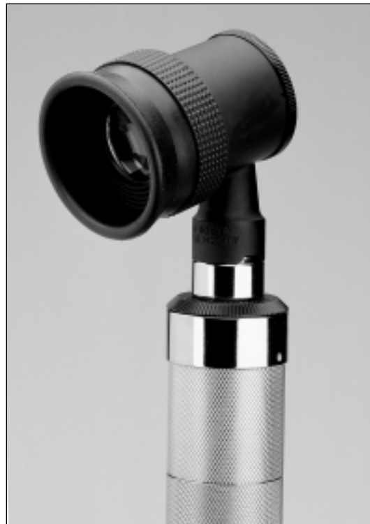
47351 3.5v EpiScope™ Skin Surface Microscope

*For appropriate model number outside of U.S.A., please advise country and voltage required when ordering.