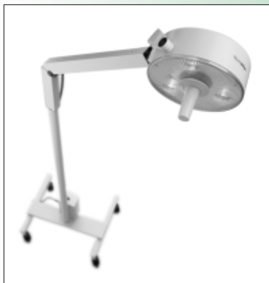
LS200 Lamp Design Luminaire