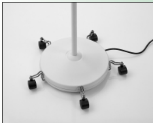
Optional Caster Base