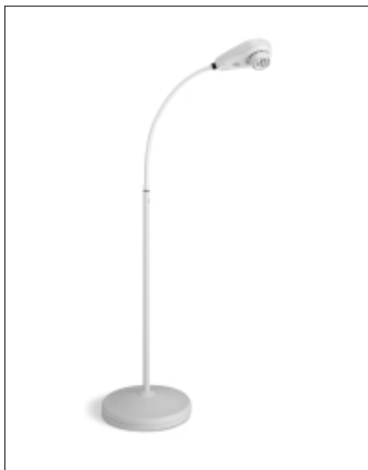
LS-150 50w Halogen Light