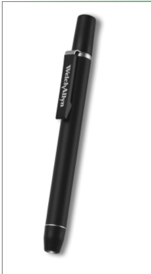
Quality Portable Hand-Held Light

Welch Allyn will repair or replace, free of charge, any parts of its own manufacture proven to be defective through causes other than misuse, neglect, damage in shipment, or normal wear.