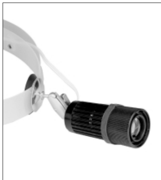
49003 Halogen Headlight