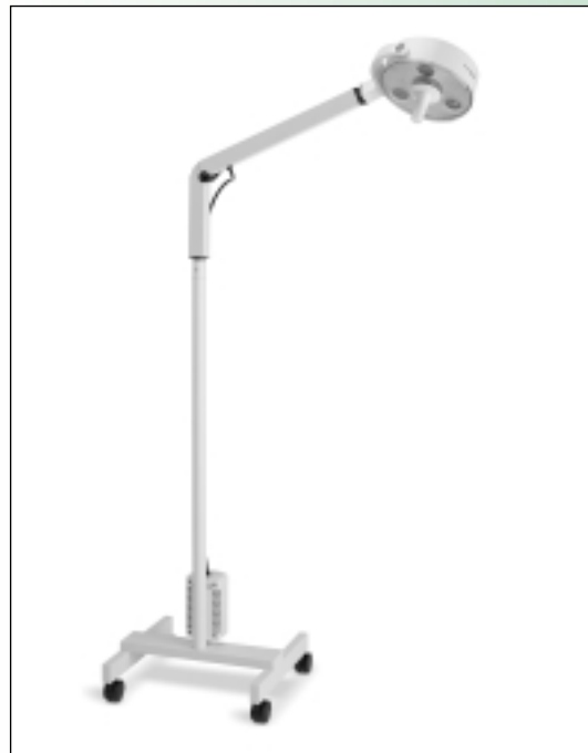
LS200 Procedure Light with Mobile Stand

*For appropriate model number outside of U.S.A., please advise country and voltage required when ordering.