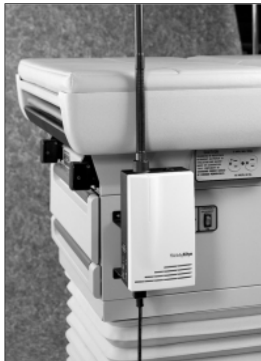
Exam Light III on Table Mount