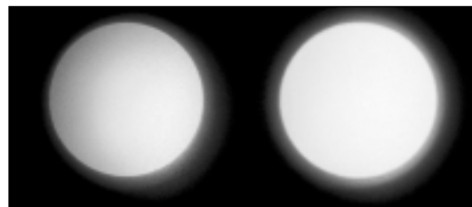
Competition Halogen Lamp vs. Welch Allyn Solarc Lamp