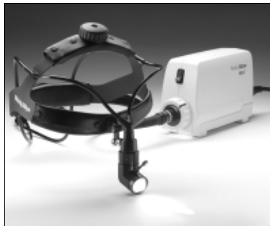
MFI Fiber Optic Headlight System

*For appropriate model number outside of U.S.A., please advise country and voltage required when ordering.