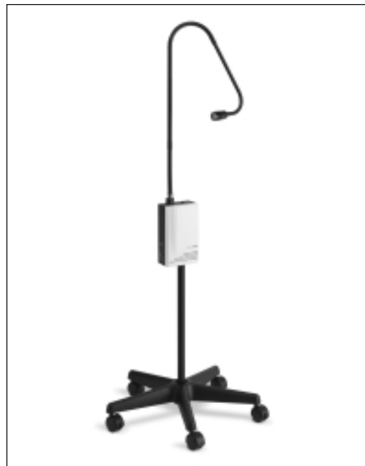
Exam Light III on Mobile Stand

*For appropriate model number outside of U.S.A., please advise country and voltage required when ordering.