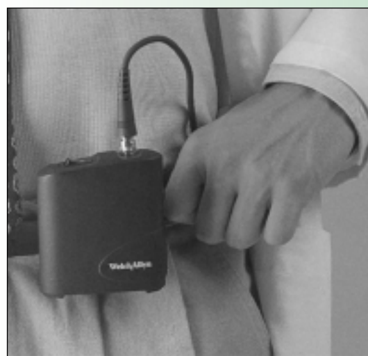
Portable Battery Pack