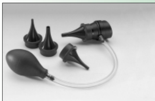
Insufflation System and Specula