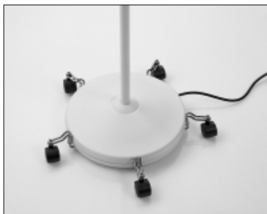
Optional Caster Base