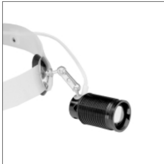
46003 Direct Focusing Headlight

*For appropriate model number outside of U.S.A., please advise country and voltage required when ordering.