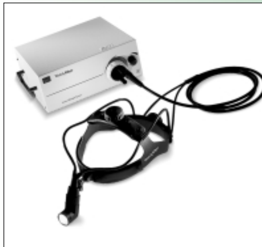
MFI Fiber Optic Headlight System

*For appropriate model number outside of U.S.A., please advise country and voltage required when ordering.