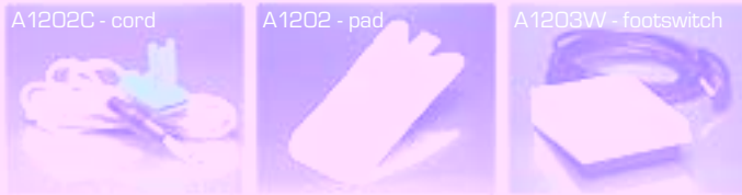
A1202C - cord