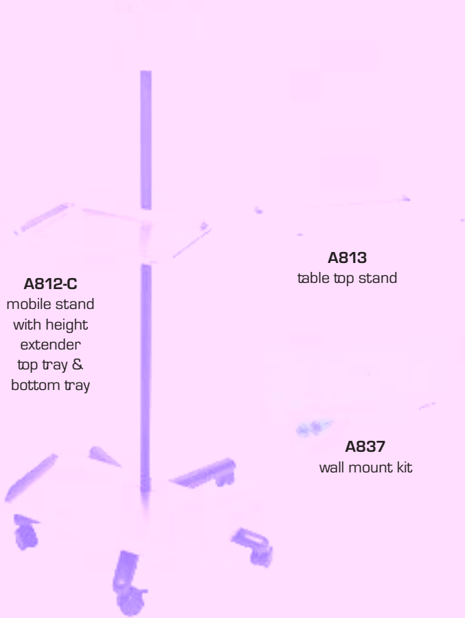
A812-C mobile stand with height extender top tray & bottom tray