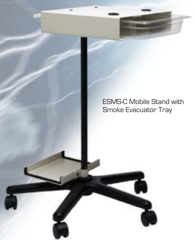
ESMS-C Mobile Stand with Smoke Evacuator Tray