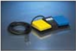
A1253 Monopolar Footswitch