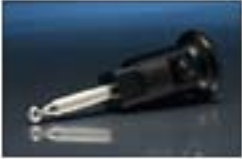
A1255A Adapter for Connecting Footswitching Pencil