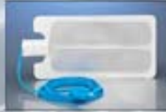
ESREC Split Grounding Pad with 2.8M cable