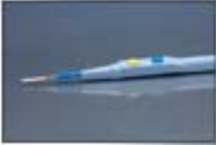
ESP1 Cut & Coag Control, Disposable