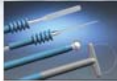
Electrodes of the physician's choice. (Blades, Balls, Needles, Loops)