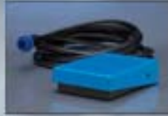
BV-1254 Bipolar Footswitch