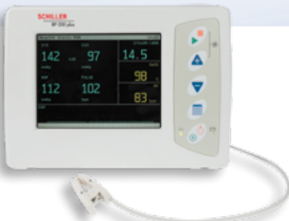
SpO 2 with MASIMO technology (option)