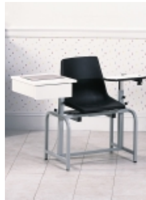
6029-P Blood Drawing Chair • One piece plastic seat • Adjustable height arms 27"–33" • Laminate pivot armrest • Easy-clean one-piece drawer Seat — 17" wide x 16" deep x 20" high Overall — 43" wide x 26" deep