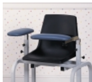
674 Optional Padded Armrest • Same as standard laminate armrest with the added comfort of upholstery.