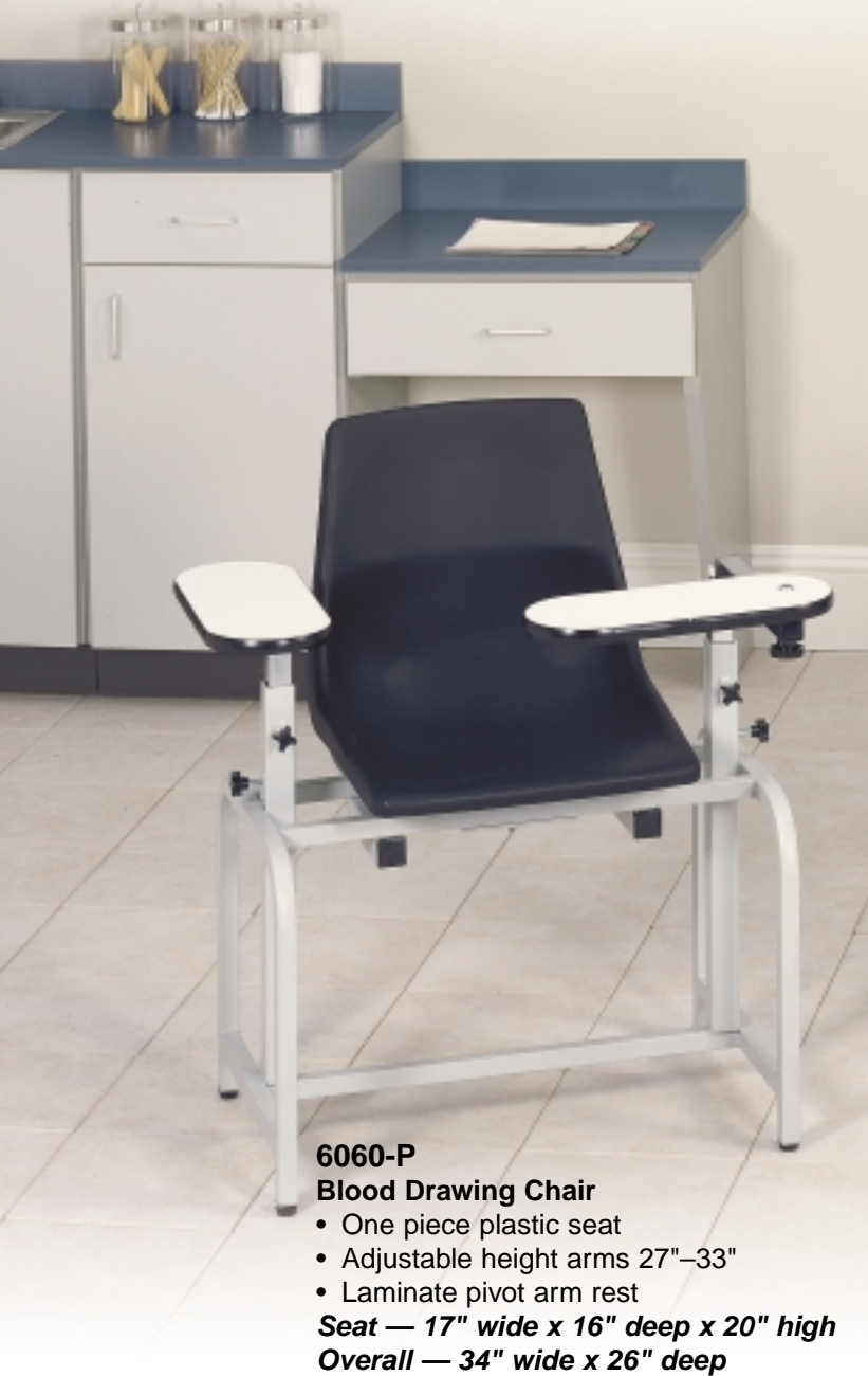
6060-P Blood Drawing Chair • One piece plastic seat • Adjustable height arms 27"–33" • Laminate pivot arm rest Seat — 17" wide x 16" deep x 20" high Overall — 34" wide x 26" deep