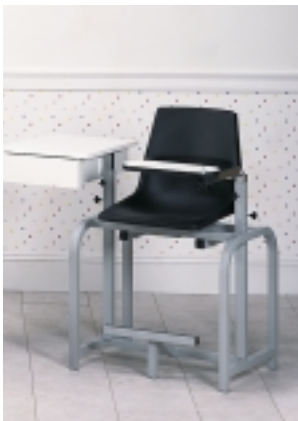
6022-P Extra-Tall Blood Drawing Chair • Reduces constant bending • One piece plastic seat • Adjustable height arms 34"–40" • Laminate pivot armrest • Patient foot rest • Easy-clean one-piece drawer Seat—17" wide x 16" deep x 26" high Overall—43" wide x 26" deep