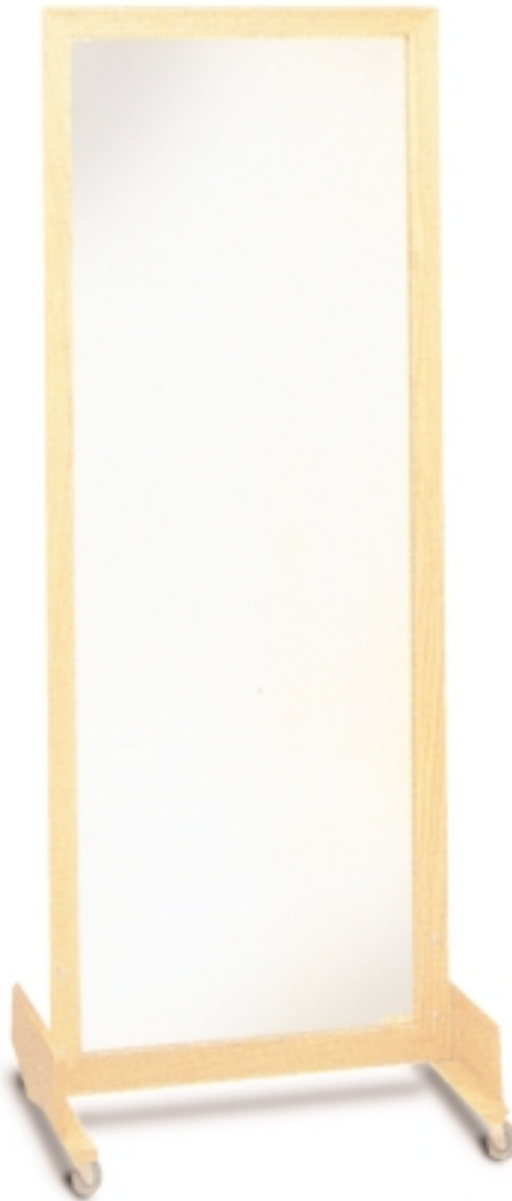
2201-9MO Mobile Mirror 27" wide x 72" high

These fine Signature Series mirrors feature ANSI safety backed mirror glass framed in the classic beauty of natural solid oak—crafted the Clinton way for long lasting service.