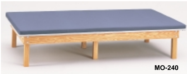
MO-240 Upholstered Mat Platform