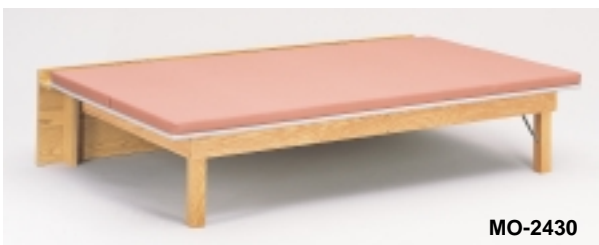
MO-242 Folding Mat Platform Projects only to 8" when folded against the wall