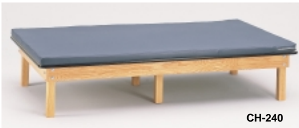
CH-240 Electric Lift Mat Platform Power mat platform with upholstered top