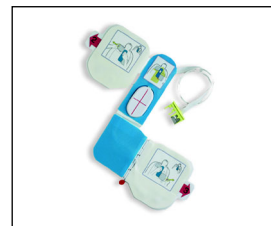
CPR-D•padz offer clear anatomical placement illustrations and a CPR hand-positioning landmark.

The unique one-piece design of ZOLL's CPR-D•padz addresses these problems by orienting the simple design to the head while using the easily remembered CPR landmark (the sternum) as the key placement cue. Packaging is then removed by a simple pull after positioning. Because this is the same placement taught for CPR hand position, AED users benefit from having to remember only one easy landmark for both interventions.